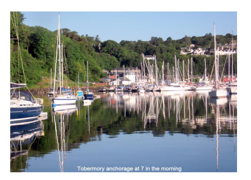
E:\July Cruise 18. - Rev04 July 28.docx