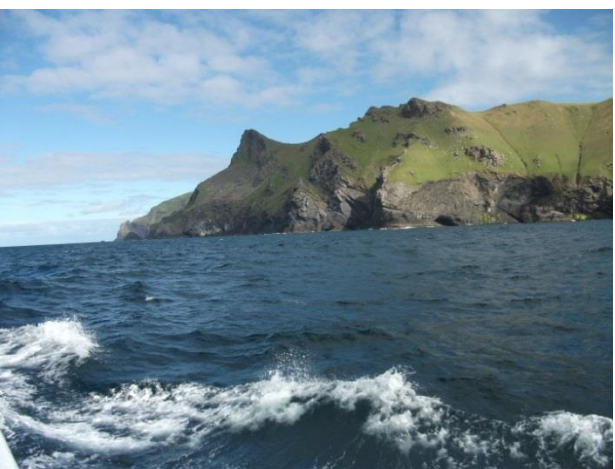
Awesome cliffs surrounding the relatively more gentle valley where the population of St Kilda had their settlement.

The fertile area around the Village sloping to the higher ground belies the ferocious cliffs on the other side of Hirta. It's said that the hills have no back to them, and that if you were to take another step once you were on the tops, you would be faced with a drop of 1,000 feet. Similarly the rocky nearby islands of Soay and Dun have these massive cliffs.