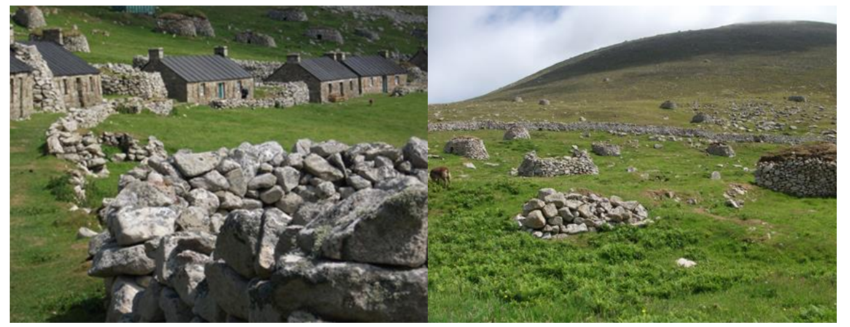
Remains of The Street

I've highlighted only small aspects of what I saw in my 3 of 4 hours ashore.